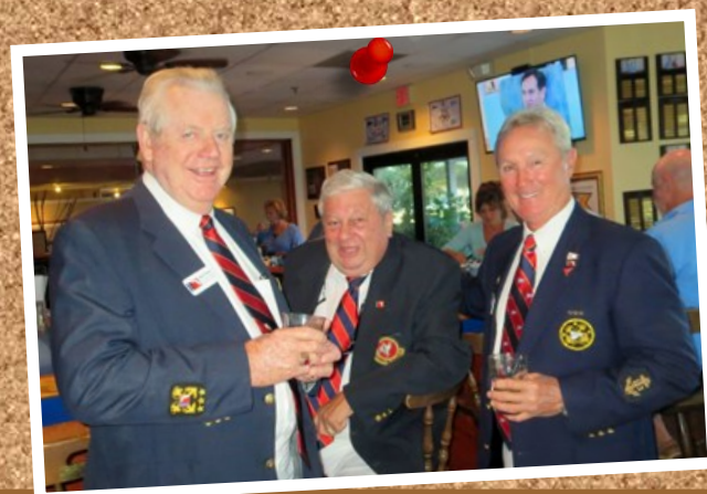
Fall Meeting Pensacola Yacht Club October 21 - 22, 20146