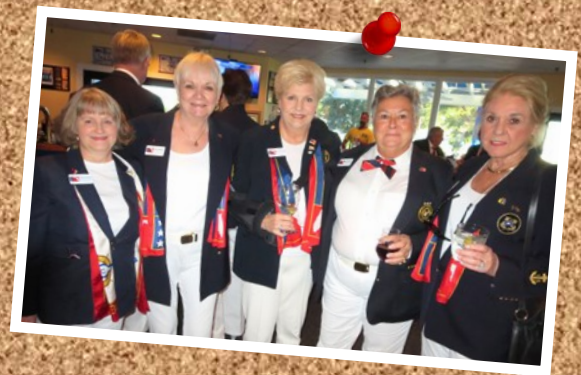
Fall Meeting Pensacola Yacht Club October 21 - 22, 2014