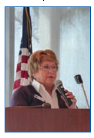
(Continued on page 3)

We were not surprised to learn that it was more media hype than responsible