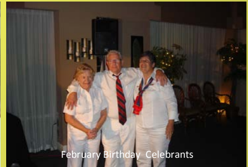
February Birthday Celebrants