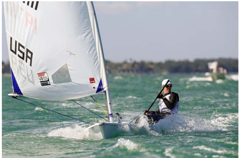
January, 2013: ISAF Sailing World Cup Miami. 309 sailors from 37 countries compete in 13 classes on Key Biscayne.