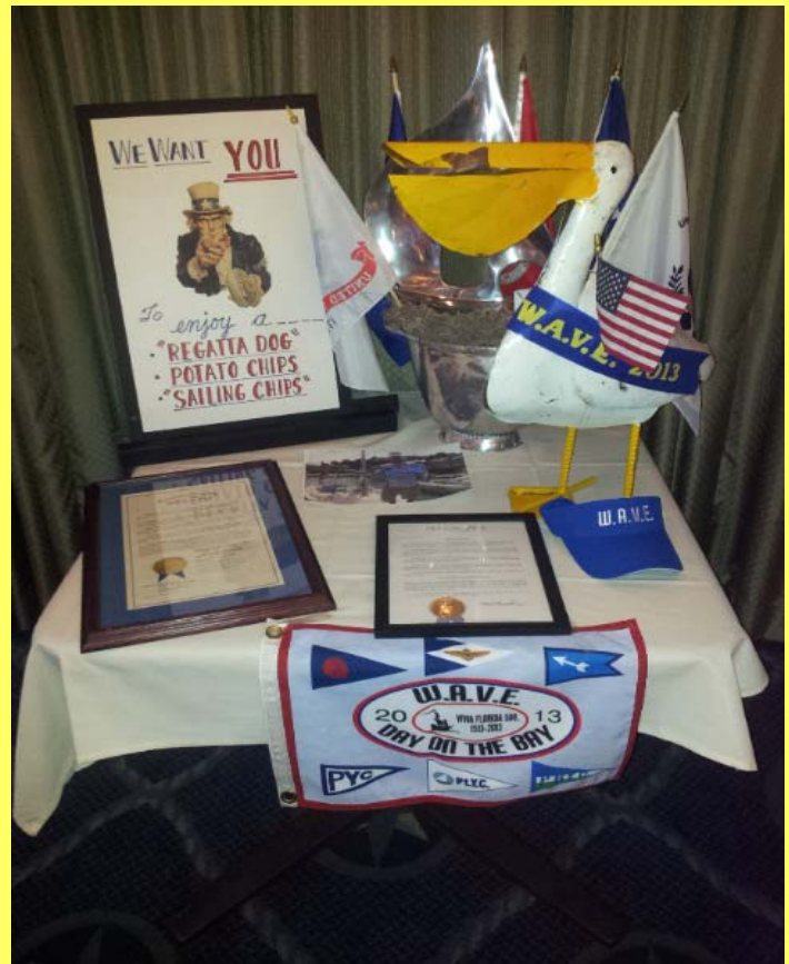
The information on the WAVE, an FCA supported event to honor Our Wounded American Veterans. The WAVE was created by Navy Yacht Club Pensacola in 2012.