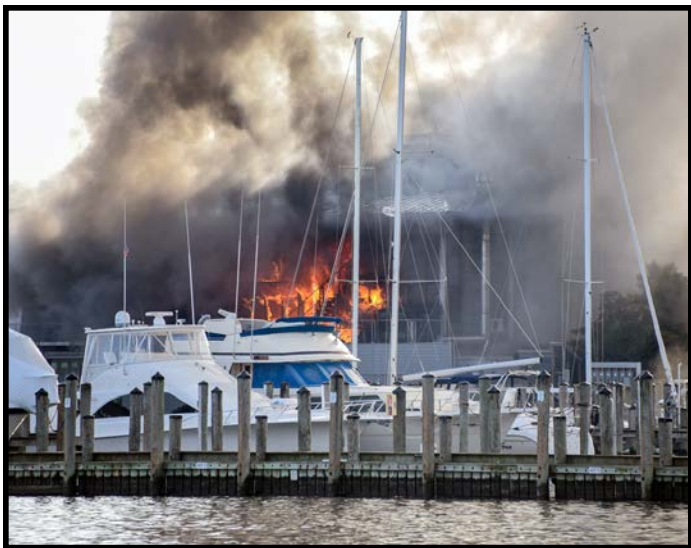
Annapolis Yacht Club engulfed in flames.

On December 12, just hours before the start of their annual lighted boat parade, the Annapolis Yacht Club was destroyed by a fire caused by an electrical malfunction. The fire raged through the second and third stories ("decks"). Wooden hull models burned and silver sailing trophies melted.