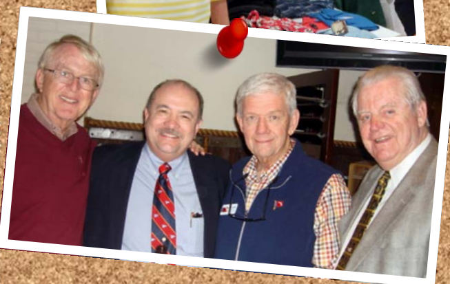
Winter General Meeting St. Andrews Bay Y C Panama City February 5 -6