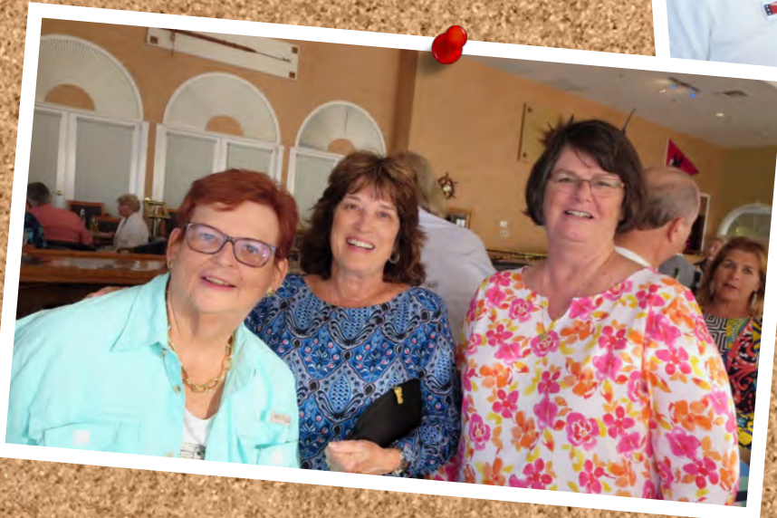
Spring Meeting Pelican Yacht Club April 21 - 22, 2017