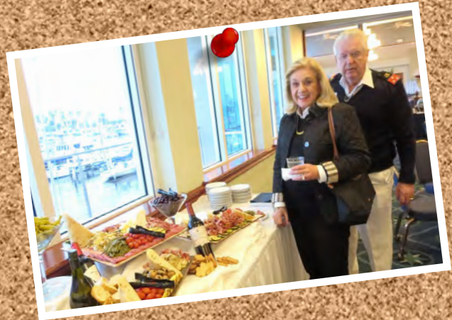
Winter Meeting Halifax River Yacht Club February 2 - 3, 2018