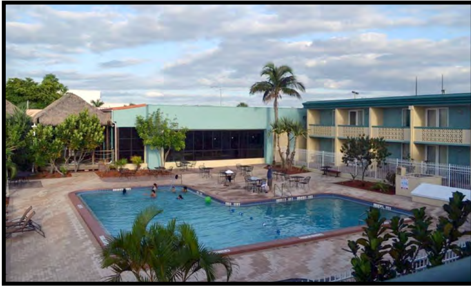
PG Waterfront Hotel 300 West Retta Esplanade Punta Gorda, FL 33950 (941) 639-1165