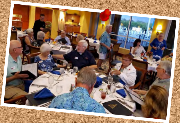
Fall Meeting and Change of Watch Port Charlotte YC October 25 - 26, 2019