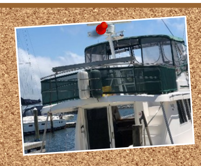
New flag display device on the flybridge of Persistence .