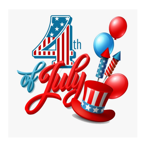
Freedom is not Free!

WAVE, Wounded American Veterans Event is a simple "thank you" extended to the brave men and women who keep us safe.